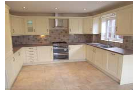
Example of Kitchen from alternative development

IMPORTANT NOTICE: Howard Cundey LLP, their clients and any joint agents give notice that: 1. They are not authorised to make or give any representations or warranties in relation to the property either here or elsewhere, either on their own behalf or on behalf of their client or otherwise. They assume no responsibility for any statement that may be made in these particulars. These particulars do not form part of any offer or contract and must not be relied upon as statements or representations of fact. 2. Any areas, measurements or distances are approximate. The text, photographs and plans are for guidance only and are not necessarily comprehensive. It should not be assumed that the property has all necessary planning, building regulation or other consents and Howard Cundey LLP have not tested any services, equipment or facilities. Purchasers must satisfy themselves by inspection or otherwise. 34710