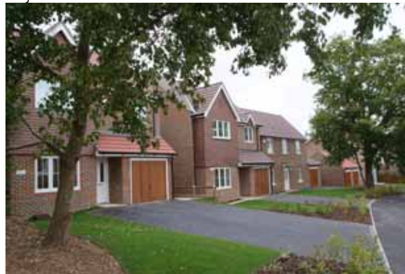
Example of street scene from alternative development

From East Grinstead town centre, proceed on the A22 towards Felbridge. Turn left into Halsford Park Road and immediately right proceeding behind the small green. The entrance to the site will be found immediately in front of you, adjacent to number 16.